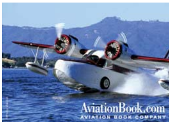
The Aviation Store and Aviation Books (www.theaviatorsstore.com)