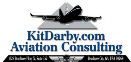
KitDarby.com Aviation Consulting