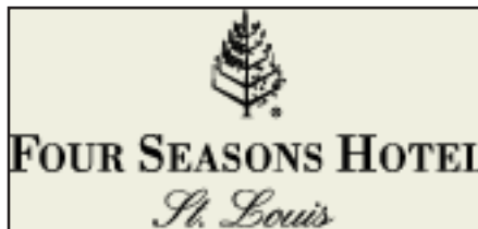
Four Seasons Hotel Saint Louis