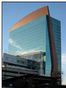
Four Seasons Hotel

St Louis has a continental climate – spring comes early and everyone has assured me the second week of May should be balmy with temperatures in the mid to high 70s (25 C) in the daytime (90 degrees F – 30C is not unheard of). There is a chance of showers, so you