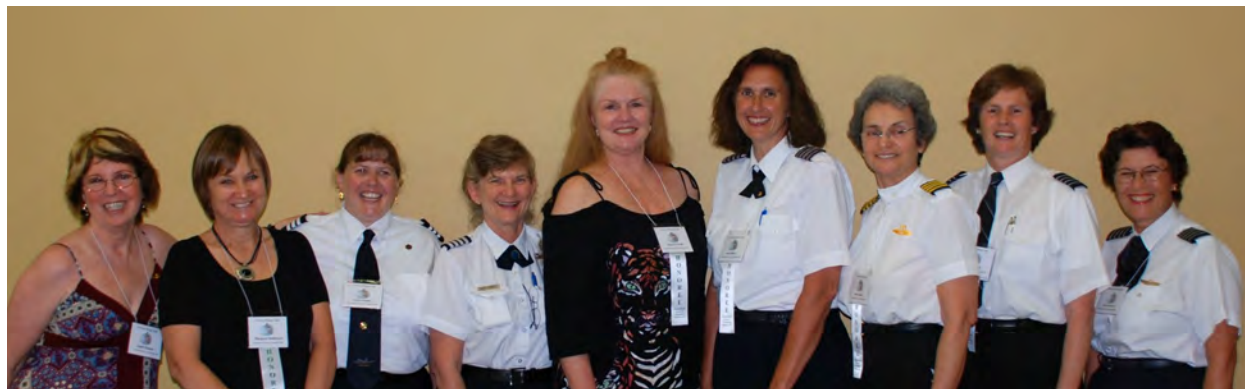
ISA at the Forest of Friendship Luncheon