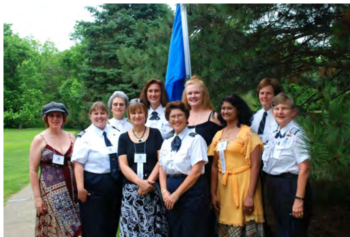
ISA at the Forest of Friendship Induction Ceremony

Including a complete list of Honorees, see www.ifof.org .