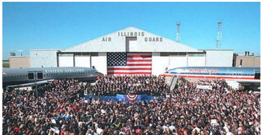
More than 6,000 airline employees crowd together on the tarmac at Chicago's O'Hare International Airport to meet President Bush and honor their industry colleagues Sept. 27. "I think it's interesting that on one side, we see American; on the other side, it says United," said the President in his remarks. "Because that's what we are — America is united."

'I will not forget this wound to our country or those who inflicted it. I will not yield; I will not rest; I will not relent in waging this struggle for freedom and security for the American people.' --President George W. Bush before Joint Session of Congress