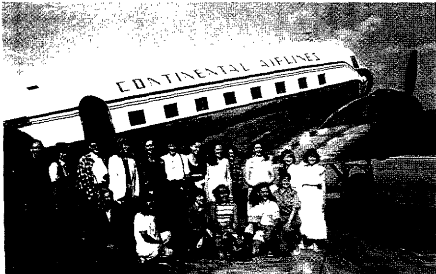
A memorable DFW-HOU flight for ISA members.

A final ending to the week was the optional NASA trip to Houston. A small group flew down in style in a restored DC-3, where we were served champagne and pastries by stewardesses (correct term for the period!) in white gloves and period uniforms (even seams in their stockings!). We all got to fly, and all agreed it was a memorable trip!