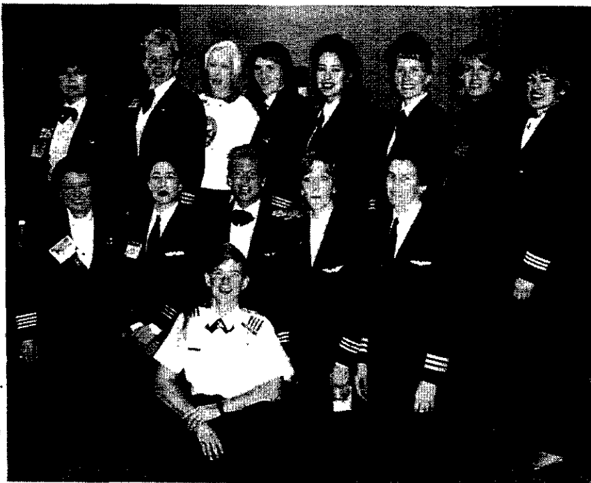
ISA members enjoyed the Women in Aviation Conference.