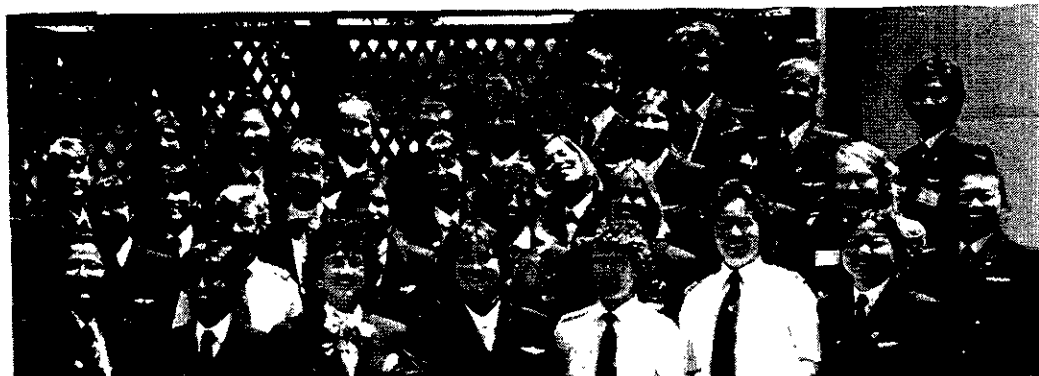
Thirty-two ISA members from non-USA airlines represented countries from around the world.