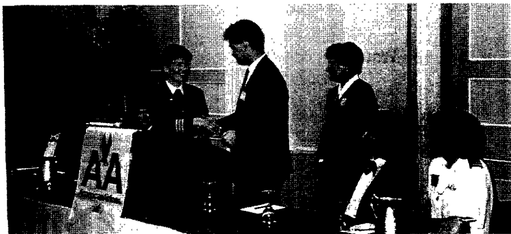
ISA Board of Directors at the Press Conference, sponsored by American Airlines.

(Editor: Details of the Annual ISA Business Meeting are in the Secretary's Minutes following this article.)