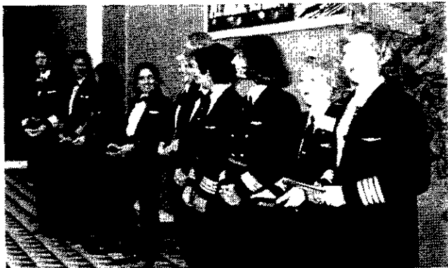
Some of the Captain's Club recipients are shown at the luncheon ceremony.