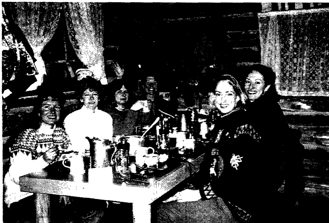
International Society of Women Airline Pilots