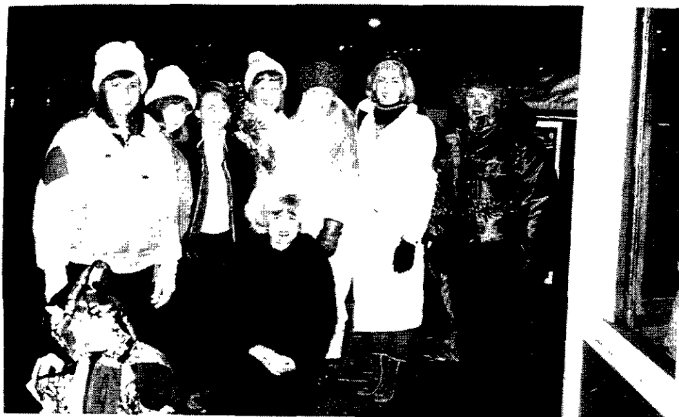
International Society of Women Airline Pilots