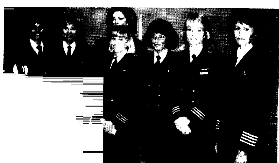
Delta Airlines Group