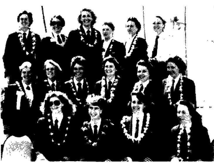
US Air/Piedmont Group